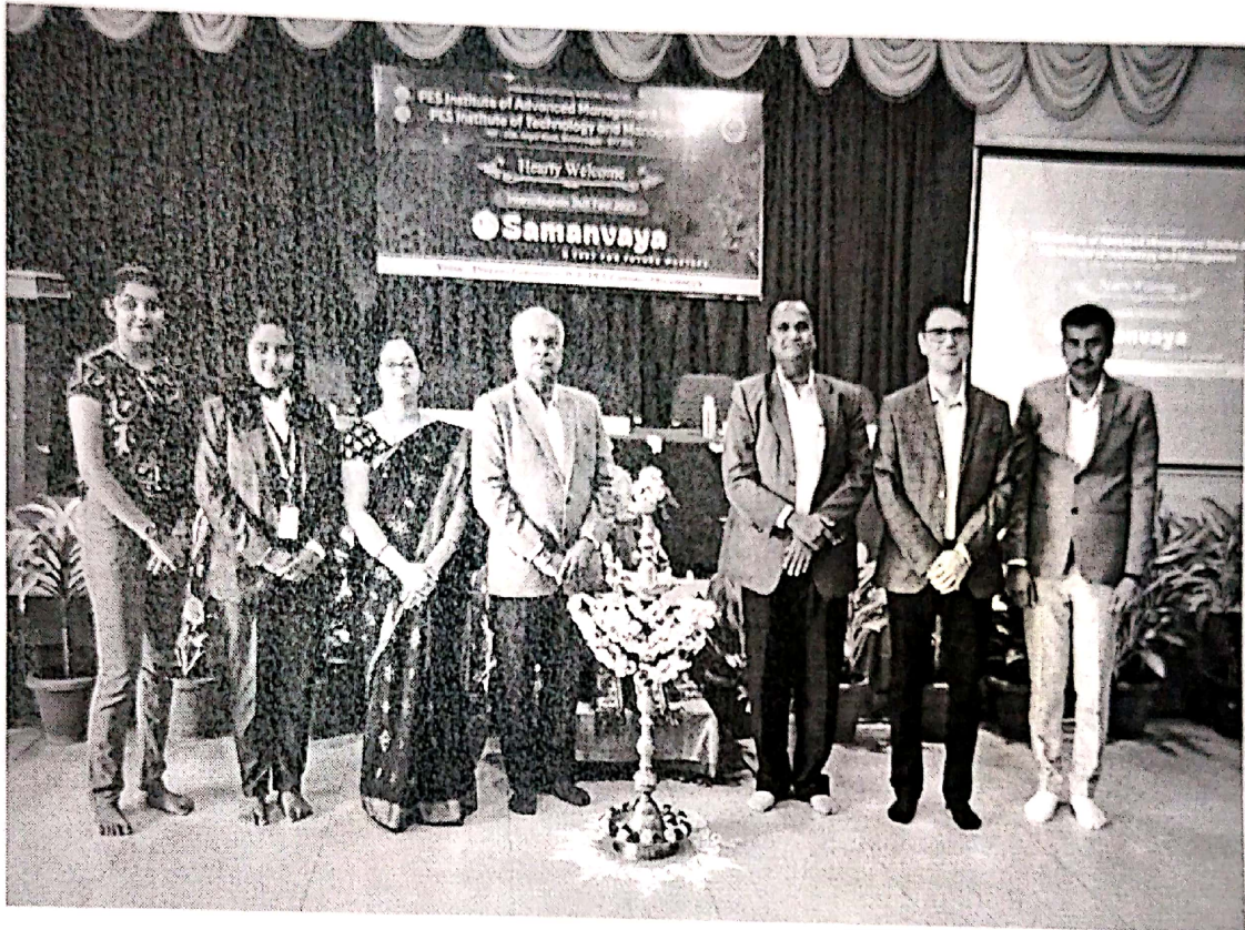
Samanvaya 2023 Event Inauguration- 7-7-2023

Organized by PES Institute of Advanced Management Studies and PES Institute of Technology & Management, Samanvaya 2023 aimed to promote holistic development and provide students with an opportunity to exhibit their skills. The collaborative efforts of the PG Department of Commerce, MBA, and MCA departments ensured the success and smooth functioning of the event.