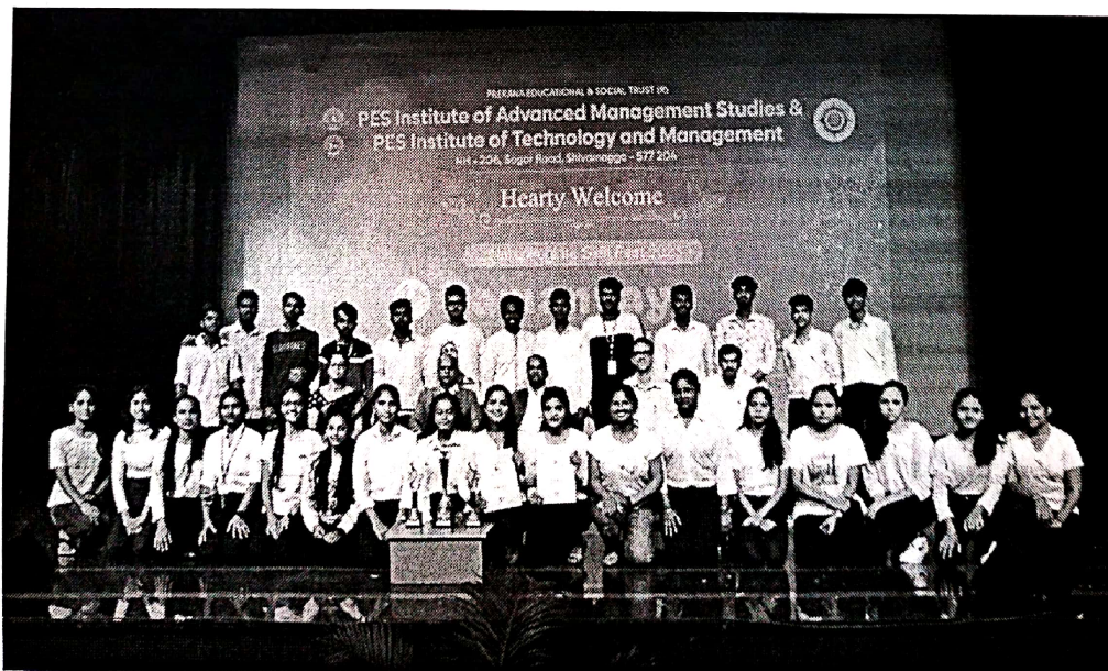
Overall Runner Up - ATNCC .Shivamogga

During the event, 22 teams comprising 240 students from 12 different colleges in and around Shimoga city participated in Samanvaya 2023, creating an atmosphere of healthy competition and skill development. NES Advanced Institute of Management, Shivamogga emerged as the Championship, while ATNCC, Shivamogga claimed the overall runner up.